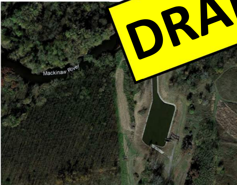
Side Channel Pumping Pool